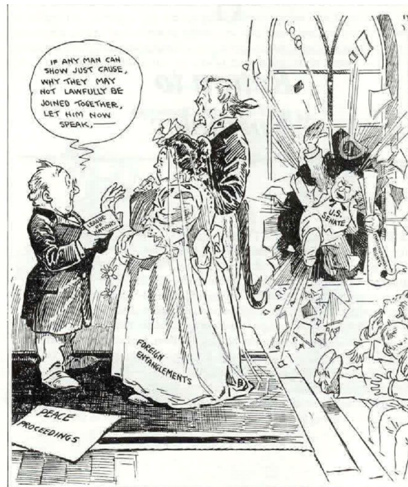
John T. McCutcheon. The Tribune (Chicago), 1918.